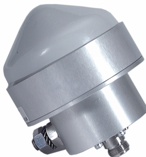
GPS installation kit included GPS antenna

HUBER+SUHNER group is certified according to ISO 9001 and ISO 14001.